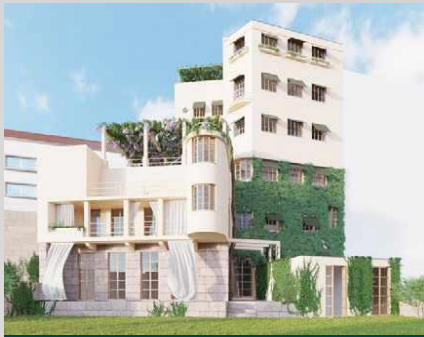
Casa das Lérias