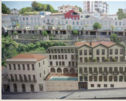
The Riverview Hotel