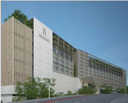
Porto Lapa Park Renaissance Hotel