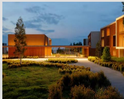
Lagos Beach & Sports Resort