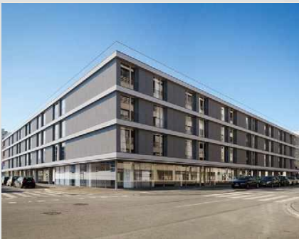
Four Points By Sheraton