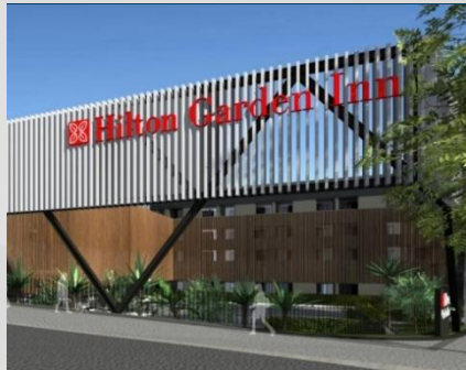
Hilton Garden Inn