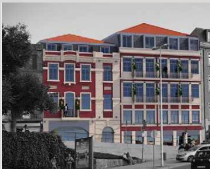
Sé Catedral, Tapestry Collection by Hilton