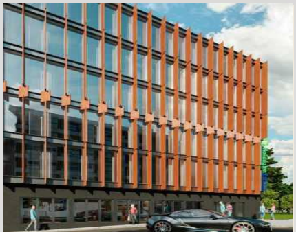
Holiday Inn Express Porto