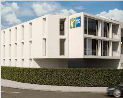
Holiday Inn Express Évora