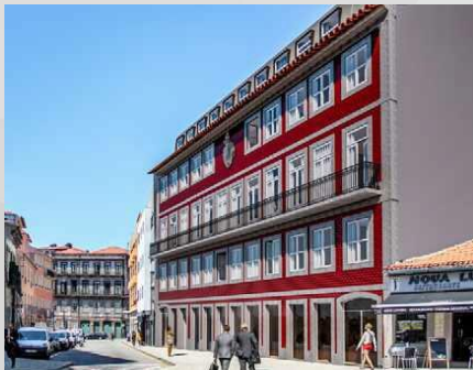
Porto Art 's Hotel