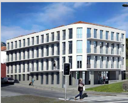
Porto Art's Suites