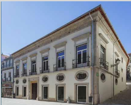
Casa da Companhia